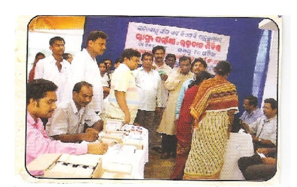
HEALTH CHECK-UP CAMP

The programme is to foster neighborhood development committees in low income neighborhood areas for effective participation of urban poor in programme implementation. The ULBs have utilized 77.57 lakhs towards Social services like health, education, welfare, training and awareness camps.