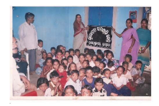
A FUNCTIONAL BALWADI