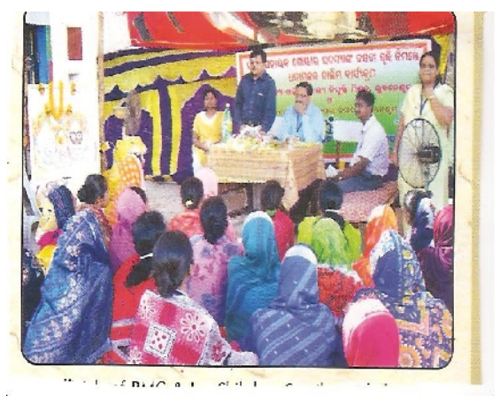
TRAINING & COUNSELLING OF T&C/SHG GROUP