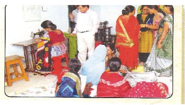
SKILL UPGRADATION TRAININ