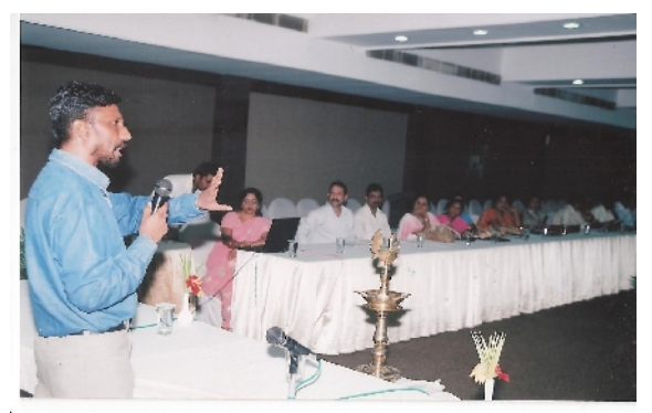
CAPACITY BUILDING OF UPA FUNCTIONARIES THROUGH TRAININGS